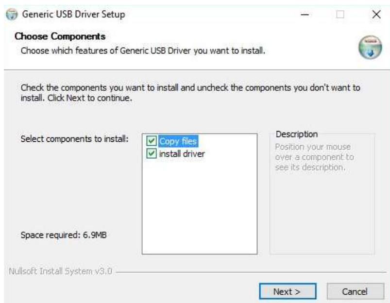
Figure 2 Choose Components Screen

Step2: The Choose Components screen appears,please click "Next".